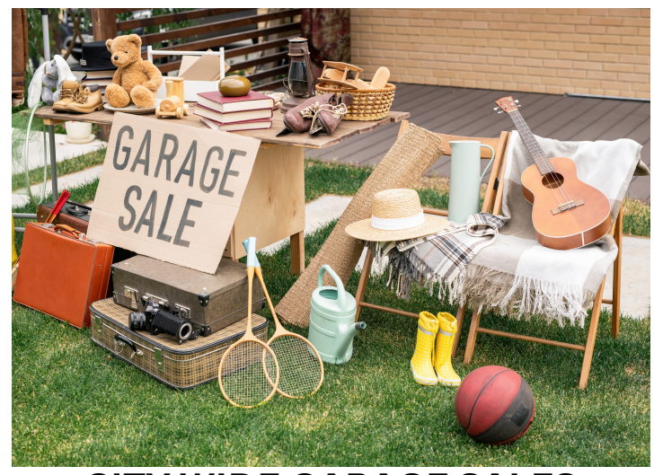
CITY WIDE GARAGE SALES MAY 3-4TH!

Open the second Saturday of each month! Clothing is free to the public!! Donations can be left on the porch in plastic bags. (no boxes or loose clothing please)