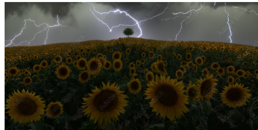
Sunflower Field During Thunderstorm in Summer