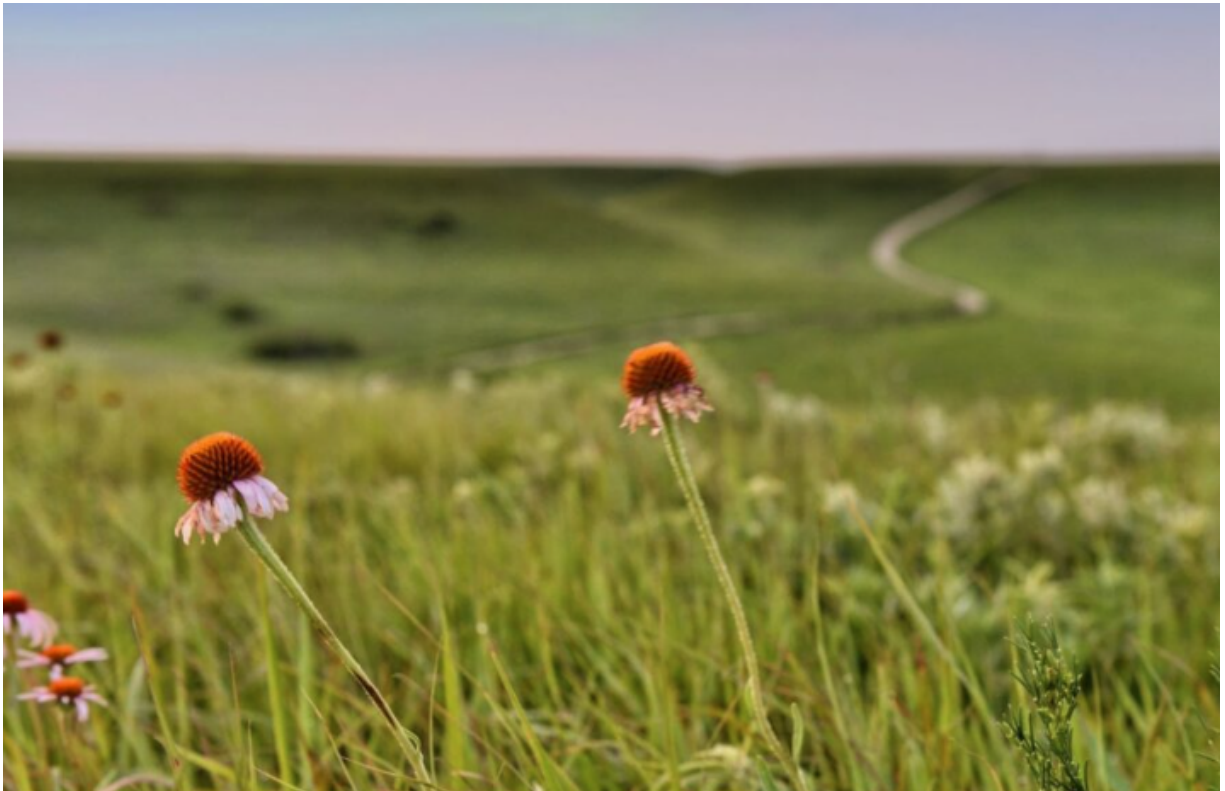
Konza Prairie

We are sending our Chit-Chats out via email as well. Our emailed copies are in color and have many more features that our printed can't offer. If you'd like a copied emailed, send us a message on Facebook or an email at udallcty@cityofudall.com