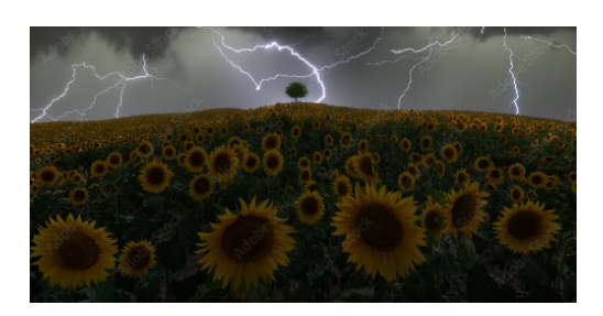
Sunflower Field During Thunderstorm in Summer