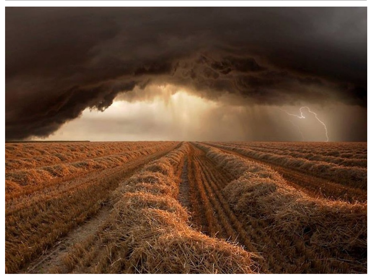
Kansas Summer Storm

We are sending our Chit-Chats out via email as well. Our emailed copies are in color and have many more features that our printed can't offer. If you'd like a copied emailed, send us a message on Facebook or an email at udallcty@cityofudall.com