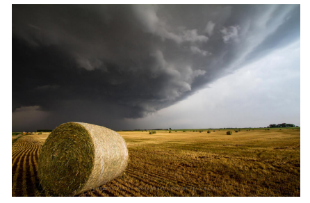
Round Hay Bale in Field Under Storm in Kansas Southern Plains Photography